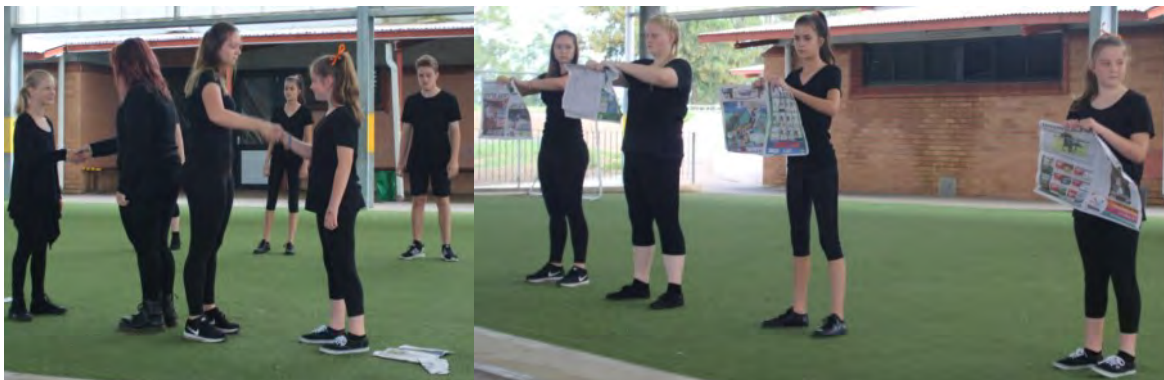
RTHS Drama Ensemble performing on National Day of Action against Bullying.