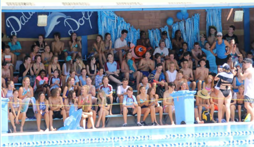
CARNIVAL HOUSE WINNERS DALWOOD DOLPHINS