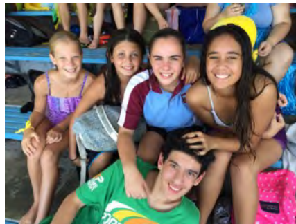
Year 7 students enjoying the Swimming carnival.

A reminder that it is important to be setting good school habits early, to ensure that quality learning can occur in the classrooms and this does mean coming to school as often as possible and bringing a note when you are sick and catching up on missed work. There are some great rewards for students who have excellent attendance and remember you can't earn VIVO points when you are away.