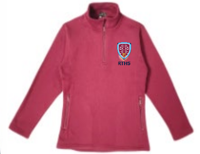
Maroon Knit Fleece