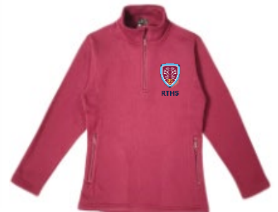
Maroon Knit Fleece