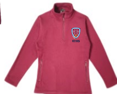
Maroon Knit Fleece