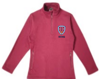
Maroon Knit Fleece