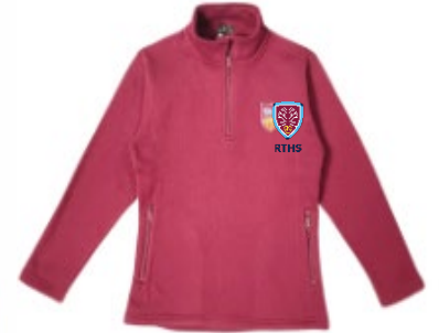
Maroon Knit Fleece